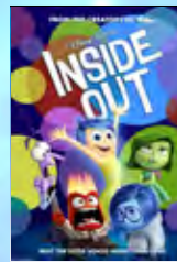
Friday, February 5