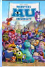
Friday, March 4

Only $1 for anyone with Fraser Public School ID.